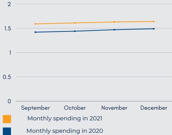
MONTHLY CONSTRUCTION SPENDING (In billions of dollars)