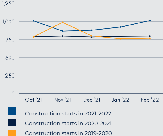
TOTAL VALUE OF CONSTRUCTION STARTS (In billions of dollars)

Because of the pandemic, labor shortage has been a major challenge for all industries these past couple of years. On the contrary, construction has seen growth within their industry, with construction jobs reaching pre-pandemic numbers. The unemployment rate decreased to 3.8%, and job growth was widespread.